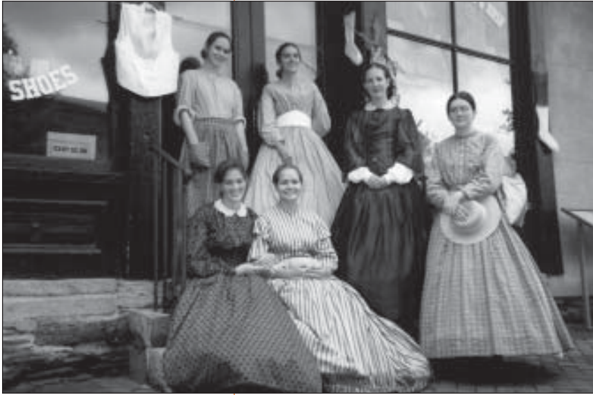
Youth Conservation Corps (YCC) students help park staff provide living history interpretation in Lower Town Harpers Ferry.

July 22-23 – I Will Follow Them To the Death: Sheridan’s Soldiers 1864 – Presents Harpers Ferry as the staging area for Union General Philip Sheridan’s Shenandoah Campaign. Members of the reactivated living history group 11th New Jersey will demonstrate Union army garrison duties such as guard mount parade; searching and arresting spies, deserters, and traitors; processing prisoners of war; searching citizens; and maintaining military security in an occupied enemy town.