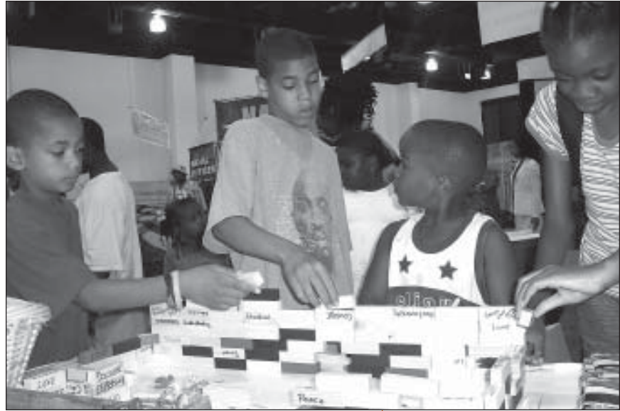
Kids build a “freedom house,” one of many activities that will take place at the Youth Discovery Tent.

Front and back sides of Niagara Centennial medallion, produced exclusively for the 2006 commemoration.