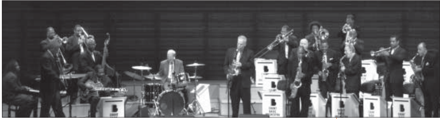
The "World Famous Count Basie Orchestra" performs on Saturday evening, August 19, at 7:00 p.m. and features an original score commissioned especially for the Niagara Centennial.

writing focuses on African American women in the 19 th and 20 th centuries. She is the author of Righteous Discontent: The Women's Movement in the Black Baptist Church: 1880 - 1920 and co-editor of African American Lives . Dr. David Levering Lewis, a distinguished Du Bois scholar, will deliver the final remarks at the symposium. Dr. Lewis has twice been awarded the Pulitzer Prize for his two-volume biography of Niagara founder W.E.B. Du Bois.